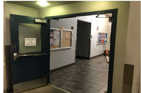
Door : Keeping Open as many as possible