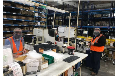
PPE: Mask, Safety Glass, Face Shield (Face-to-Face)