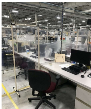
Production Office Partition (Face to Face)