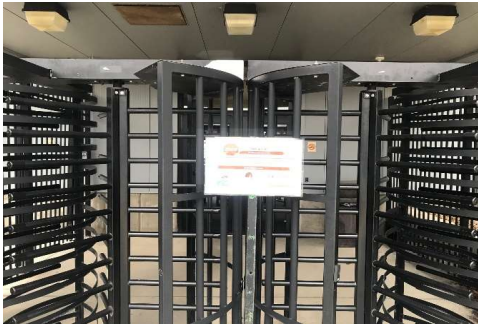
Entrance: limited entrance to screening Notification policy of symptom